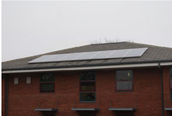
PV panels installed at Barley Hill school with the help a Low Carbon Communities Programme grant

The Energy Busters project has been busy over the past three months, visiting seventeen Primary schools, three secondary and two Special needs schools.