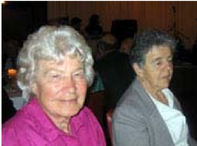
Frail Older Person