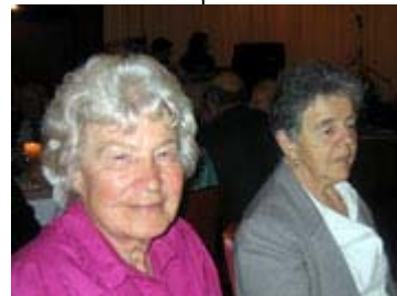
Frailer Older Person