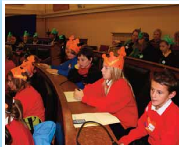
First Children's Parliament, Nov 2010

Oxfordshire Education Business Partnership Business Ambassadors' Scheme is continuing to grow and a network of training providers has also been established. This work will become more and more focused on increasing opportunities for young people to undertake an apprenticeship.