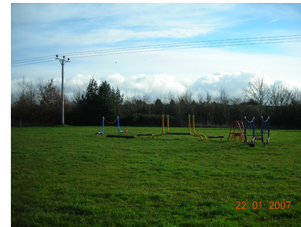
Existing play equipment to be repositioned to layout to be agreed with Witney Town Council

Reproduced from the Ordnance Survey material with the permission of Ordnance Survey on behalf of the Controller of Her Majesty's Stationery Office © Crown copyright. Unauthorized reproduction infringes Crown copyright and may lead to prosecution or civil proceedings. 1000023343 (2007). Do not scale this drawing