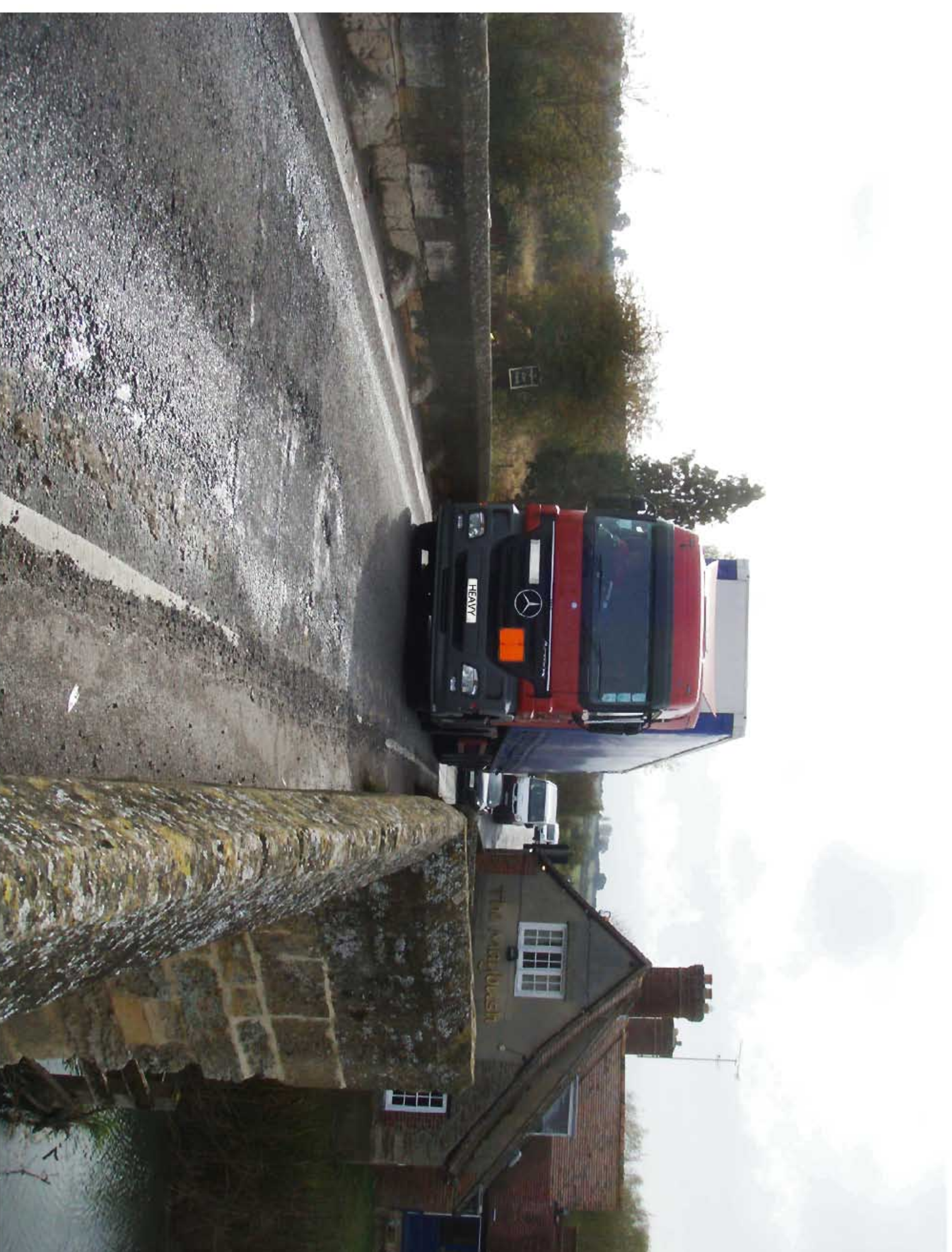
Photograph taken 2009 looking south across Newbridge