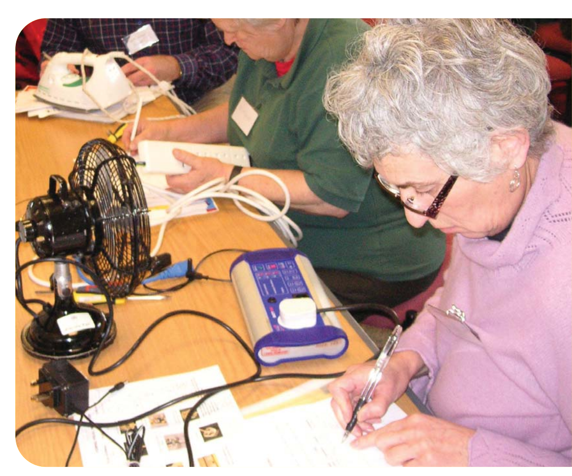
CAG volunteers PAT testing at a swap shop event

Oxfordshire County Council in conjunction with OWP has provided grant funding for towns to go "plastic bag free". Three projects were supported during 2008/09. Funding was provided to groups in Wallingford and Woodstock to produce and promote reusable shopping bags. Funding was also provided to the Oxfordshire Town Chambers Network to set up local reward schemes, where local schools and community groups benefit from reward points earned by shoppers when using reusable shopping bags.