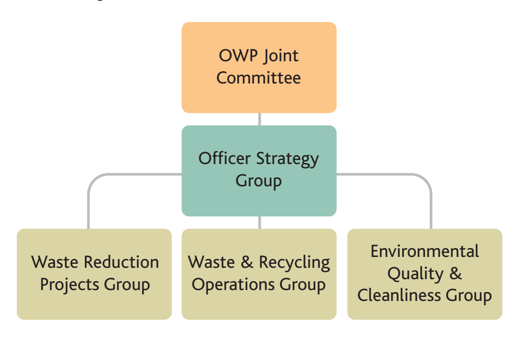
Figure 1 – OWP organisational structure

The OWP Joint Committee is supported by an officer group structure outlined in figure 1 below.