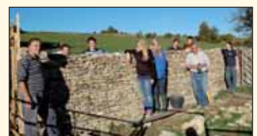
The walling gang take a welcome break in the sun and show off the results of their work

popular footpath passes nearby and many walkers stopped to admire the work and complement the volunteers who were mainly young members of Wychwood v. The novice wallers soon became familiar with the struggle to find just the right stone for that tricky gap and really enjoyed the mental as well as the physical demands of this rural craft. They are all hoping that the wall will stand strong for years to come so they can walk by and enjoy saying, 'See that wall? I built that'.