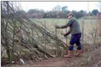
Constructing the hedge

Our second competition was held on 28 November 2010 at Breach Wood, Hailey, organised by the Wychwood Project office and members of the Hedgelaying and Coppicing Group. In complete contrast to last year, the day was dry and cold which much improved working conditions. We had nine competitors, including two new to the group.