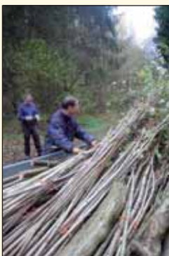
Hetherings and stakes for hedgelaying

The Wychwood Project and the Cotswold Voluntary Wardens have completed what we hope will be the first stage of an ongoing programme of coppicing at Pinsley Wood. Pinsley is an ancient woodland that lies to the south of Long Hanborough and is part of the Blenheim Estate. The Project was fortunate to receive a small grant from the Tree Council's 'Bluebell Woods fund' to help cover the costs of supporting volunteers to undertake the coppicing. By the end of the allotted three days some fifteen people had taken part,