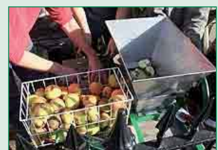
Apples collected for juicing

New orchards have been created in Chipping Norton, with the help of the Green Gym and also in Shipton-under-Wychwood (by kind permission of the Parish Council)