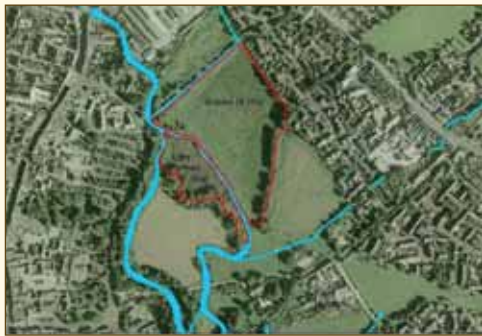
Grimes Mead and Little Grimes right in the heart of Witney