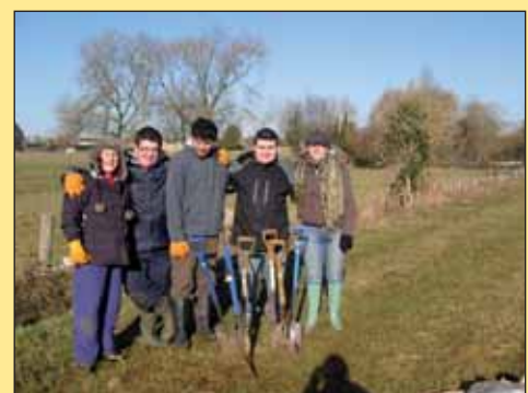
Students and staff from Abingdon and Witney College continuing the planting of a hedge started by the Cotswold Voluntary Wardens