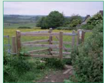
Stunning view from the new gate along a Wychwood Way circular route near North Leigh

The only problem is that 37 miles is a long way and not many people fancy walking the whole route in one go. To help with this the Project, working closely with the Cotswold Voluntary Wardens and the County Council Rights of Way Team, has identified a number of shorter circular routes that can be covered easily in a day and give walkers the chance to enjoy sections of the Wychwood Way at a more leisurely pace. Nine routes have been identified, all following existing public rights of way.