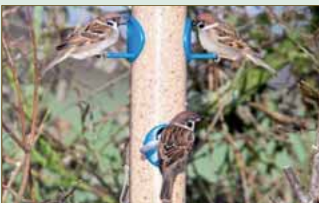
at Walk Farm

Bird Aid is delighted to tell of dramatic success of the tree sparrow feeding programme at Walk Farm, Chipping Norton where the numbers of birds has risen to a staggering 1,000 since feeding started.