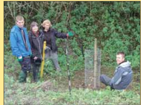
Wychwood v planting a long line of oaks along the Capps Lodge footpath starting at the Millennium Steps.