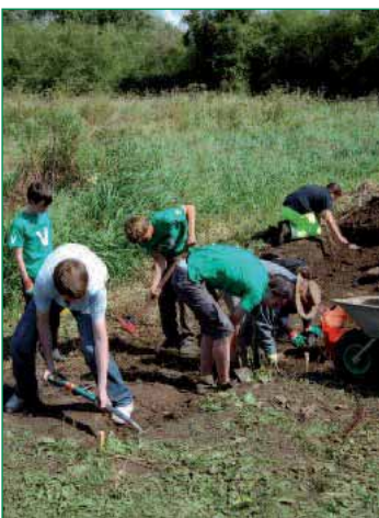
All hands to the spade at the Big Dig at Eynsham Fish Ponds