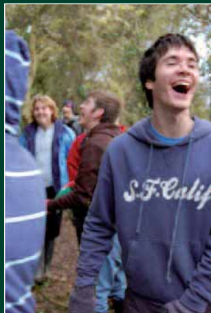
Everyone enjoying themselves on a STEPS outing

In addition to learning the practical skills of handling tools, moving materials around and making bonfires, they have made great progress in team work and awareness of safe working practices. They also derive a great deal of pleasure in visiting places in their local area that they would never visit otherwise. Wherever they have worked they impress everyone with their infectious enthusiasm and energy.