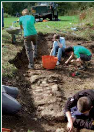
Uncovering the buried wall at Eynsham Fish Ponds