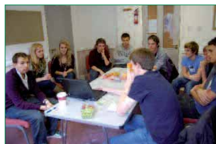
Left: The steering committee in action at the Methodist church, Witney

The future is full of opportunities for Wychwood v, and the chance to explore them promises to be very exciting.