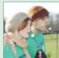
Toasted marshmallows – volunteers' perks!