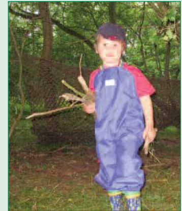
Waterproof overalls provided by the Friends of Wychwood keep the children clean and dry.

Forest Schools originated in Scandinavia in the 1950s. In Oxfordshire, Forest Schools use the outdoor environment to support children's learning across the whole curriculum, helping foster and develop confidence and self esteem. It has been found that the combination of freedom and responsibility has been particularly beneficial to children who, for whatever reason, struggle within a conventional classroom environment. The experience is fun and the learning which occurs is observed and recorded in a similar way to the learning which occurs in school. The children splash about in puddles, roll in the leaves and because of the high adult/child ratios, they can safely experience types of activities that are so often prohibited, such as climbing trees or cooking on fires.