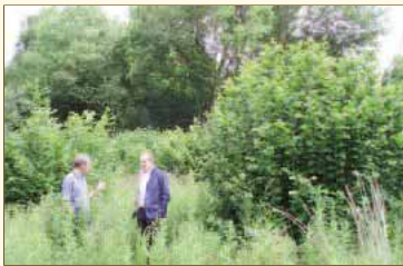
Three years' growth

Regular readers of Forest Update will recall previous articles about coppice techniques and use of hazel. The Project, working closely with the Cotswold Voluntary Wardens, has been involved in restoration of neglected coppice at several sites for a number of years. One benefit of this regular work is that we can start to see the results of our actions.