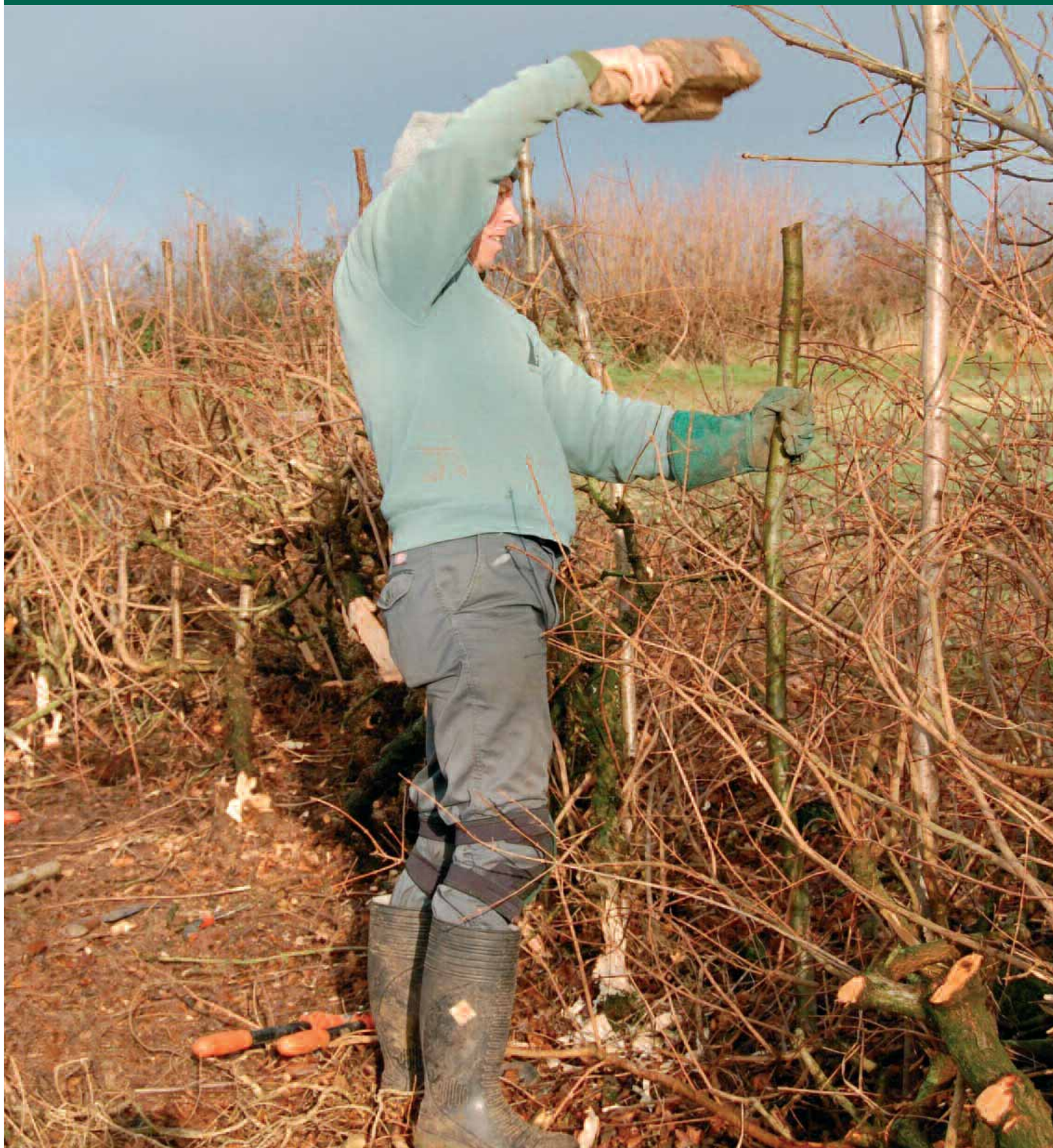
Hedgelaying – placing the stakes