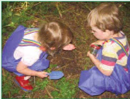
Learning about the environment first-hand – the best way.

Ideally children will attend Forest School sessions weekly throughout the year and although this isn't a specific environmental educational programme, they will experience all weathers and seasons and develop a deeper understanding about the natural world along the way. I feel the earlier children start learning about the 'outside world' the better understanding they will have later on in life.