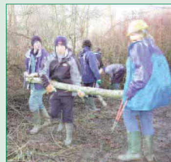
Many hands make light work.