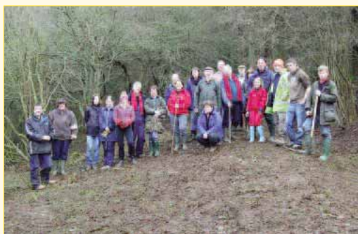
The CAT Group.

The Wychwood CAT is a new Wychwood Project initiative that provides an opportunity to do practical conservation work in the countryside at a gentle pace in a sociable setting. The group meets on the first Saturday of every month working from 10am till 1.00pm. In November the CAT cleared competing vegetation from around trees which had been planted at Swinford Lock by the young volunteers of Wychwood v last year. In December they took part in the national Tree o'clock tree planting campaign, helping to plant 243 trees at Stratfield Brake in Kidlington in association with the Oxfordshire Woodland Group and other local groups and companies.