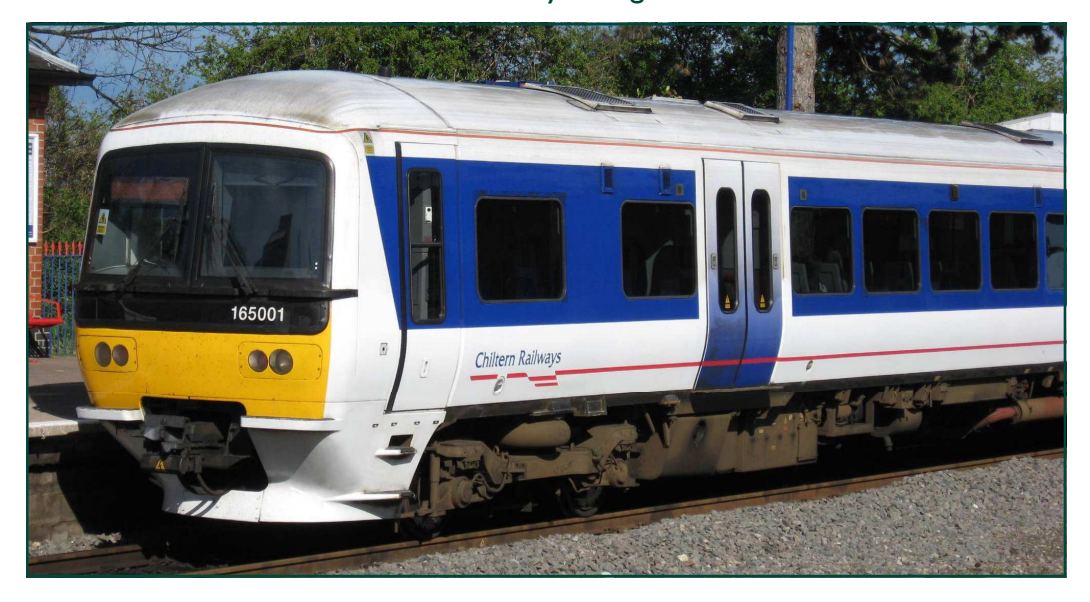
These dates may change

Alternative formats of this publication can be made available. These include other languages, large print, Braille, Easy Read, audio, computer disc or email. Please telephone 01865 815659.